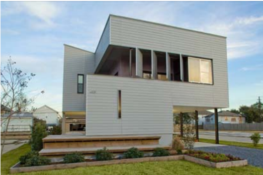
Residential bildDesign 6329 Milne Blvd.