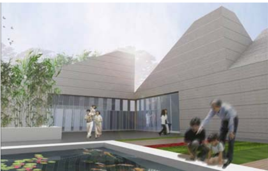
Projects Category TZCO in association with the Tulane City Center New Orleans East Louisiana Community Health Center