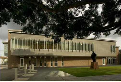
Architecture Category Waggoner+Ball Architects Siena Center/Dominican High School