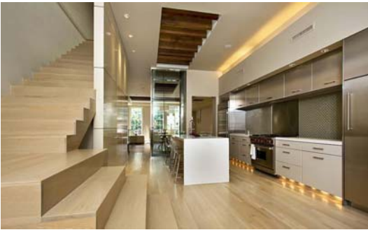
Adaptive Reuse Category Wisznia | Architecture + Development Gravier Street Residence