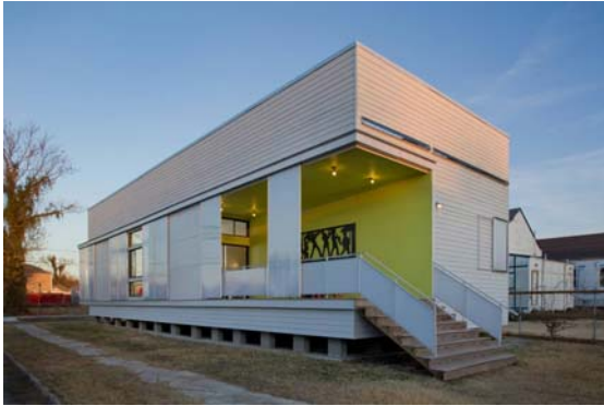
Residential Category Tulane University's URBANbuild program led by Project Architect Byron Mouton, AIA URBANbuild Prototype #4 house